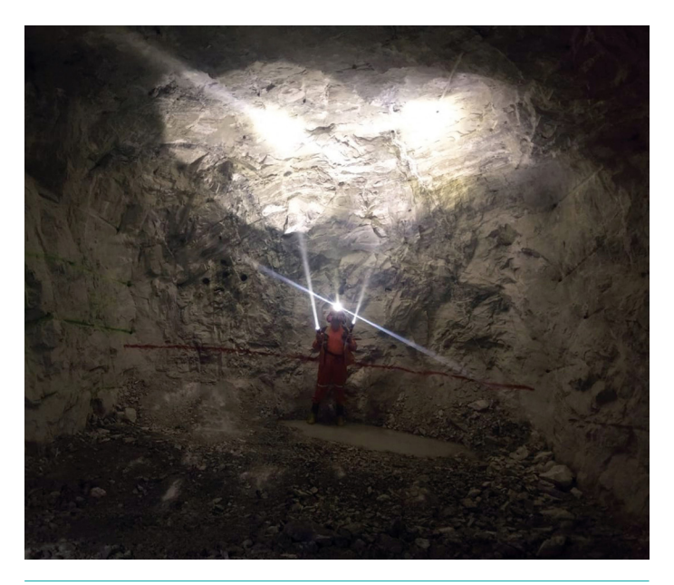
Figure 3. Quality of the work after implementing EZshot.

Estimated savings from use of EZshot US$1310.84