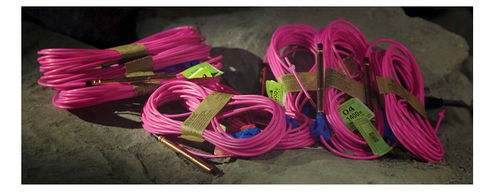
Figure 1. EZshot Electronic Detonator.